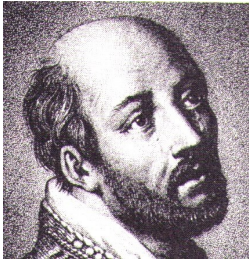
Ignatius Loyola (1491-1556). Founder of the Society of Jesus. He was canonized in 1622.

Making use of his military experience, Loyola organized the order into a “Company” - a new battalion in the spiritual army of the Roman Catholic Church. Besides the usual vows of poverty, chastity, and doing good, the professed of the order take a fourth vow of complete obedience to the Pope, which obliges them to engage in any work the Pope appoints.